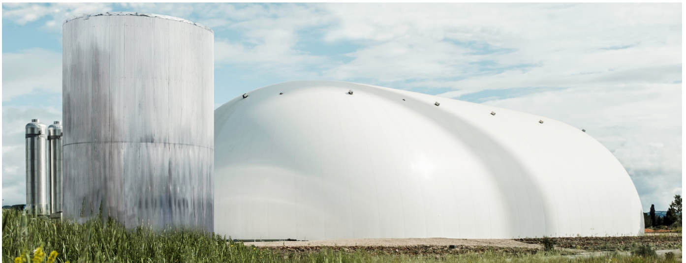
Energy Dome's CO 2 battery located in Sardinia, Italy.

The town of Pacific is an ideal location for an energy storage system due to the availability of existing electric grid infrastructure. The project, part of a multiphase site redevelopment effort, will increase energy reliability and resilience while delivering incredible value to customers. Pending approval, we expect the energy storage system to be operational by the end of 2026.