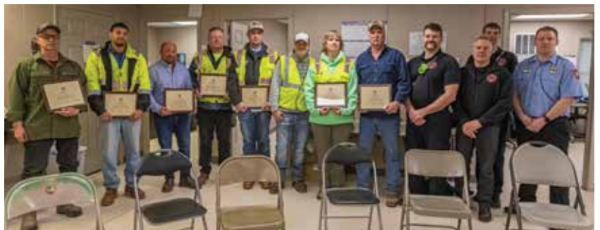
Honoring Project employees who helped save a life.

The operator experienced chest pains and was escorted to the safety trailer. There, employees administered CPR and used the site's automated external defibrillator. Local EMS arrived on the scene and stabilized the operator. Following surgery, he has since recovered and returned to work at the Wood County Solar Project in early March, just over two months after the emergency.