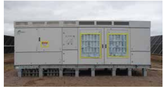
One of 41 inverters that will be on-site

Also currently under construction is the transmission line connecting the on-site project substation to the new 7-Mile Creek ATC substation on Mill Road (near Highway 73). The approximately three-mile transmission line is 90% complete as of early April. The 7-Mile Creek ATC substation is 70% complete.