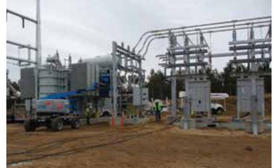
Progress is being made on the project substation