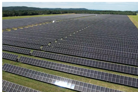
The final look of a solar project once complete (Bear Creek Solar Project, Richland County, WI).