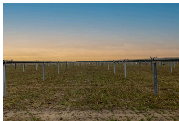
Piles and racking fully installed and await solar panels (Wood County Solar Project, Wood County, WI).