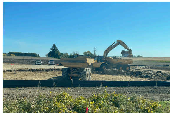
Crews begin moving dirt at the Beaver Dam Solar Project.

Sign up to receive our updates via email. They're better for the environment than print newsletters because they reduce paper waste and carbon emissions. Plus, you'll get updates faster! Contact solar@alliantenergy.com to request newsletter e-delivery.