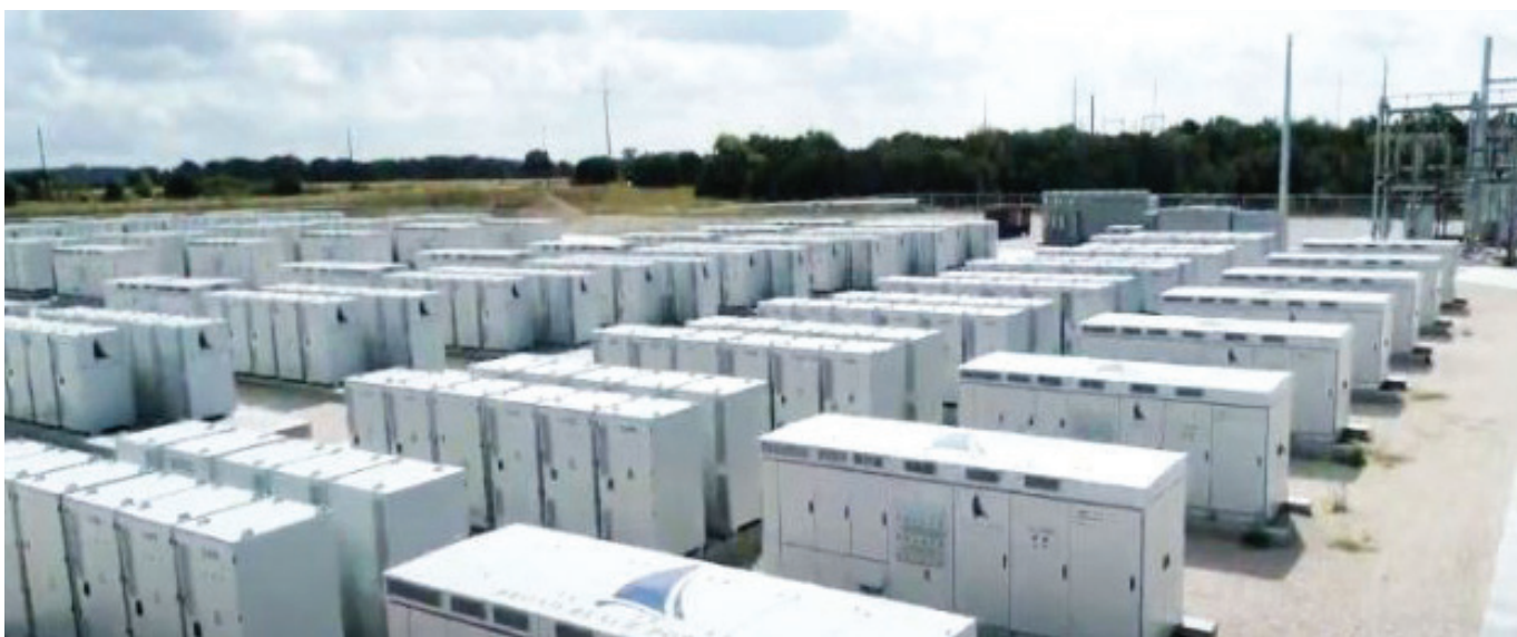
Example battery layout courtesy of FlexGen.

Battery technology has advanced rapidly, enabling new projects to deliver greater efficiency, safety and affordability. We see enormous potential for battery storage systems as we continue to accelerate our transition to safe, reliable, cost-effective renewable energy. To learn more about battery storage, visit www.alliantenergy.com/battery .